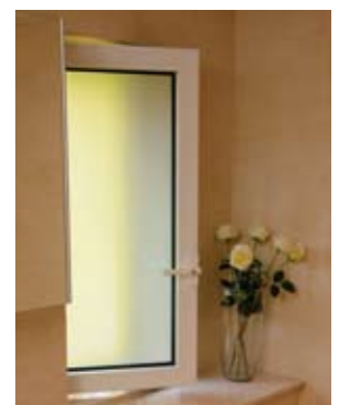
This window is shown in both its tilt and turn positions.